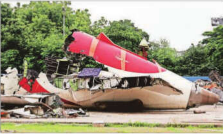
Wreckage of the Air India Boeing 787-8 Dreamliner plane sits on the open ground, outside Sardar Vallabhbhai Patel International Airport in Ahmedabad

"It has come to our attention that certain sections of the international media are repeatedly attempting to